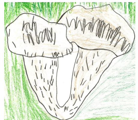
Black Trumpet Craterellus fallax