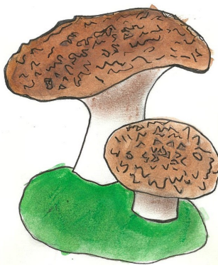
Hedgehog Hydnum repandum