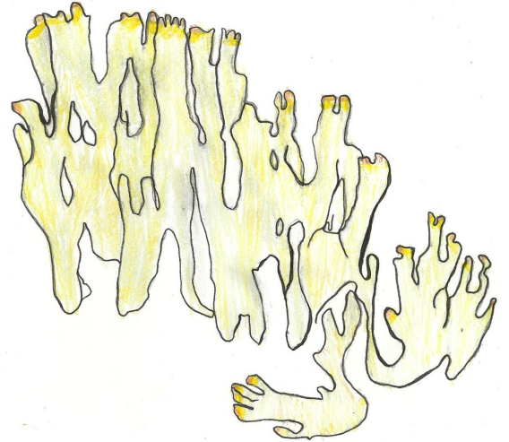
Crown-tipped Coral Artomyces pyxidatus