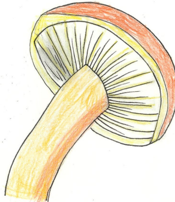
Red-banded Webcap Cortinarius armillatus