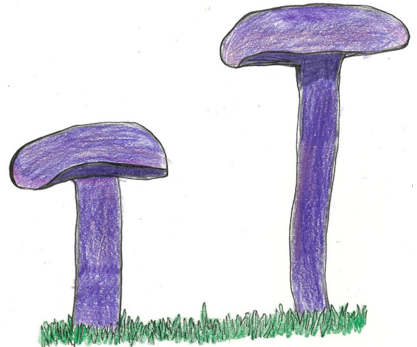
Violet Webcap Cortinarius violaceus