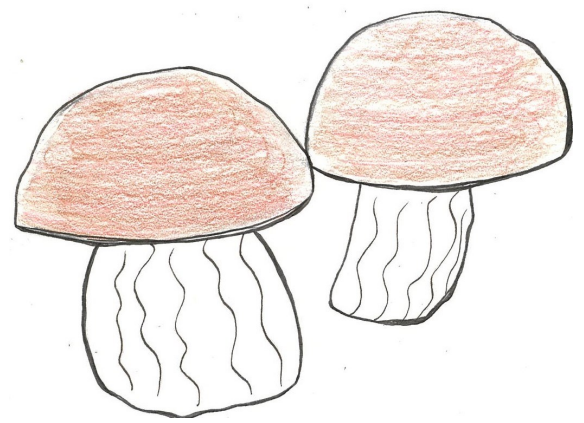
King Bolete Boletus edulis