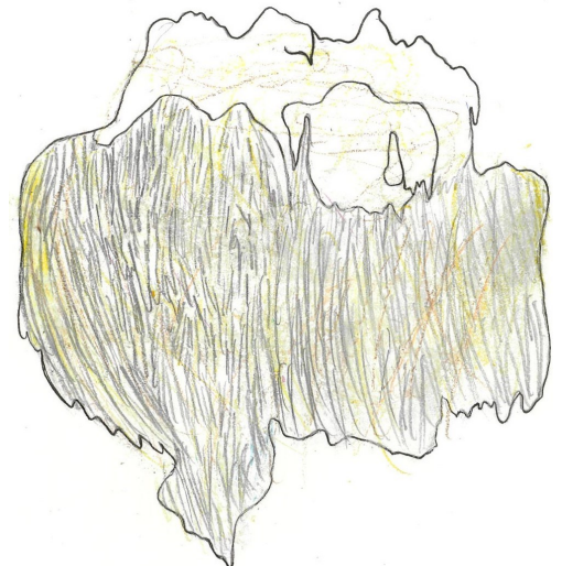
Bear's Head Tooth Hericium americanum