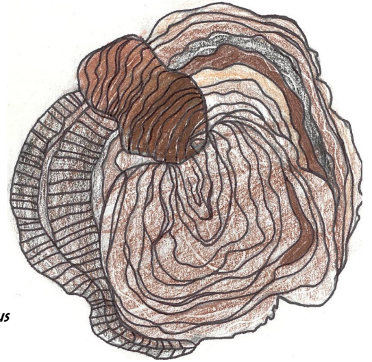
Turkey Tail Trametes versicolor