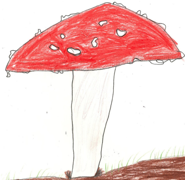
Fly Agaric Amanita muscaria