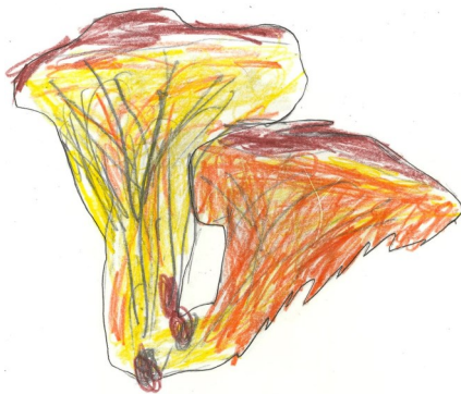
Golden Chanterelle Cantharellus cibarius