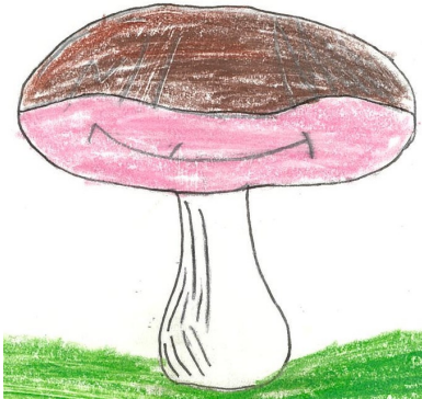
King Bolete Boletus edulis