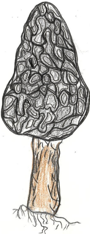
Black Morel Morchella elata