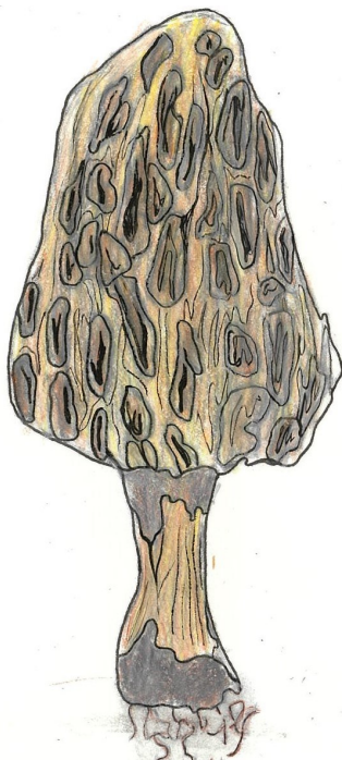
Yellow Morel Morchella esculenta