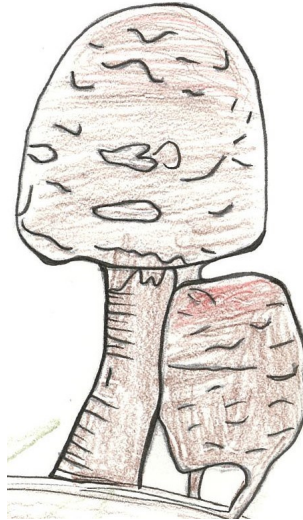
Shaggy Mane Coprinus comatus