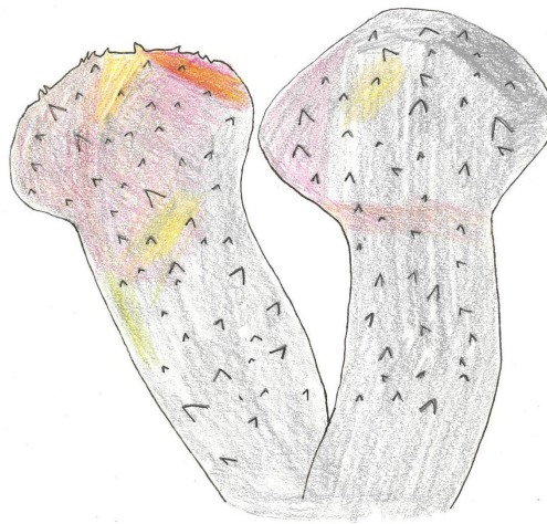
Common Puffball Lycoperdon perlatum