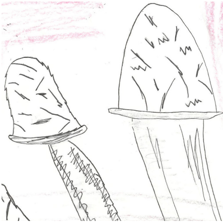
Shaggy Mane Coprinus comatus